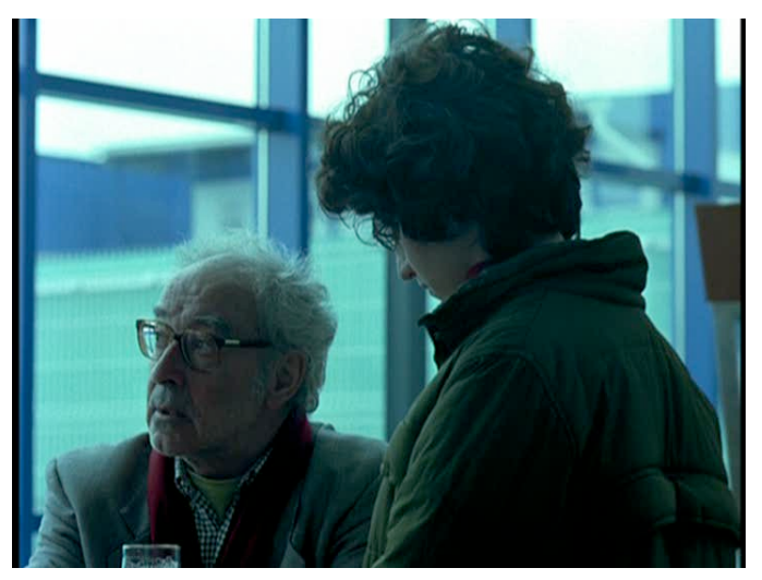
(A shot/counter-shot sequence from early in the second part of the film. These are two shots from a conversation between Godard and an interpreter. The young woman is a third and silent party to the conversation. She is in both frames of the shot/countershot and acts as a kind of witness, while Godard and the interpreter never appear together in the frame. This sequence posits the young woman as an "other" or a third eye, and breaks down the dominant positions of the classic shot/countershot system.)