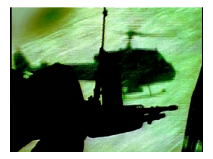
(Photographing one's own shadow. Three strands of representation: self-portrait, shadow, helicopter.)

Perhaps a sly reference to the shadow images in Plato's allegory, it certainly references apparatus and materiality at once. Upon seeing this image one might immediately say "helicopter", "shadow" or even "self-portrait," each of which would be accurate and each of which calls attention to a different aspect of the image and its creation.