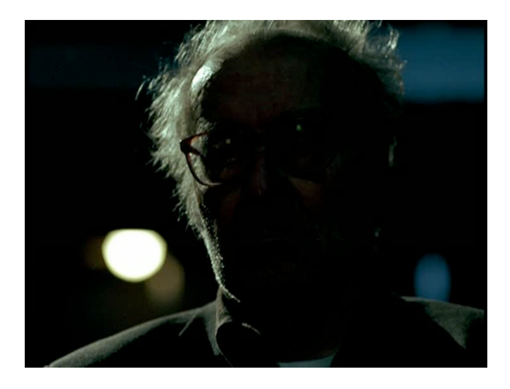
(An image of inaccessibility. Godard in stony and unresponsive silence during the question/answer period.)

response is one of stony silence. As Godard sits in silence we see him from the front, but he is backlit and in near darkness (figure 1).