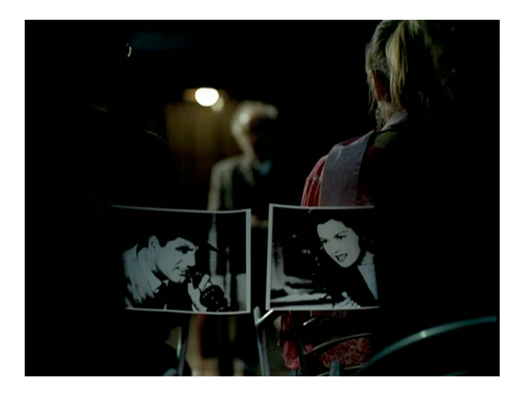
(Multiple planes of space during the lecture sequence. Godard uses shallow focus and highy restricted lighting to creates numerous planes for the different constituencies of the scene. Several individuals are always in visual obscurity and become phantomlike. This is one means by which Godard posits otherness.)