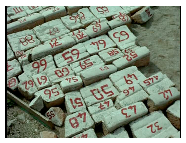
(The forensic scene at the Mostar bridge. Each stone is identified. "It was like re-discovering the origin of language.")

original state—tracking every component of the bridge as it fragments and falls (figures 6).