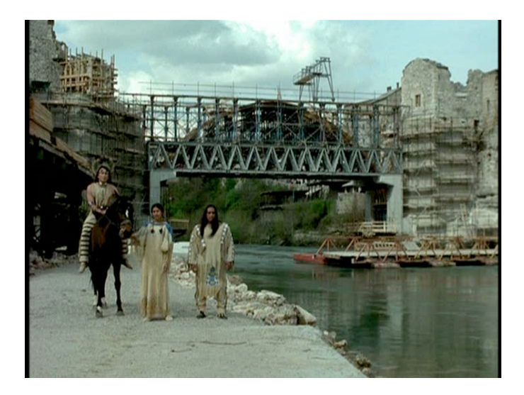
(The native Americans appear as a phantasm in full traditional regalia, rather than as flesh-and-blood, contemporary subjects.)

Not only have the clothing and physical bearing of the native Americans changed, their position in relation to her has changed. This progression of shots highlights the difference between the material reality of the world before the journalist and what she chooses to see. With this sequence Godard calls attention to the difference between the datum of vision and the discursive and imaginative realm of the visible. The scene before the journalist is not what she actually sees. Her efforts at documentation result in another moment of erasure as the native-Americans are cast according to her preconceptions and not by their on-going efforts at self-definition. The journalist with her viewfinder, seeks the ready-made or the already understood. She is not using her camera to see (or to return to Godard's remarks about using a camera, she is not using it as analytical instrument), but to reconstruct what she already knows.